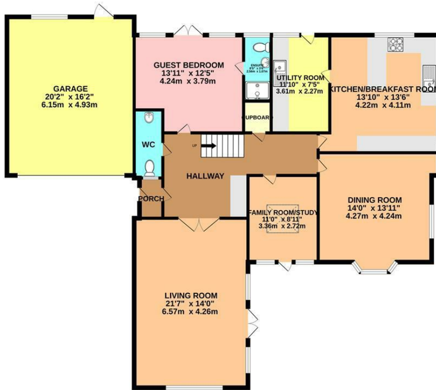
GROUND FLOOR 1667 sq.ft. (154.9 sq.m.) approx.