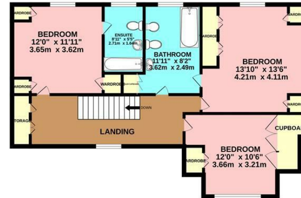
1ST FLOOR 806 sq.ft. (74.9 sq.m.) approx.