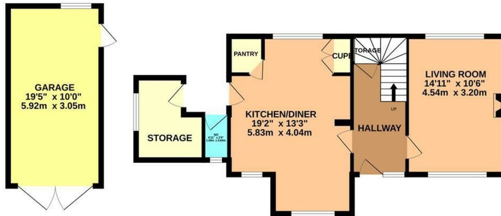
GROUND FLOOR 739 sq.ft. (68.7 sq.m.) approx.