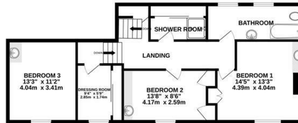
1ST FLOOR 814 sq.ft. (75.6 sq.m.) approx.