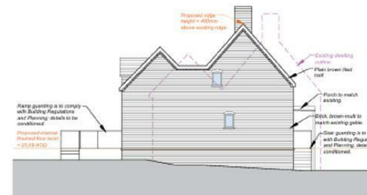
PROPOSED SIDE ELEVATION (West) Scale 1:100

These particulars are believed to be correct but their accuracy is not guaranteed and they do not form part of any contract. Whilst every effort is made to ensure the accuracy of these details, it should be noted that the above measurements are approximate only. Floorplans are for representation purposes only and prepared according to the RICS Code of Measuring Practice by our floorplan provider. Therefore, the layout of doors, windows and rooms are approximate and should be regarded as such by any prospective purchaser. Any internal photographs are intended as a guide only and it should not be assumed that any of the furniture/ fittings are included in any sale. Where shown, details of lease, ground rent and service charge are provided by the vendor and their accuracy cannot be guaranteed, as the information may not have been verified and further checks should be made either through your solicitor/conveyancer or by referring to the home information pack for this property. Where appliances, including central heating, are mentioned, it cannot be assumed that they are in working order, as they have not been tested. Please also note that wiring, plumbing and drains have not been checked.