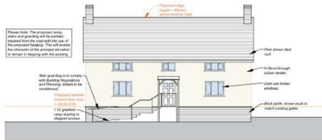
PROPOSED FRONT ELEVATION (South) Scale 1:100