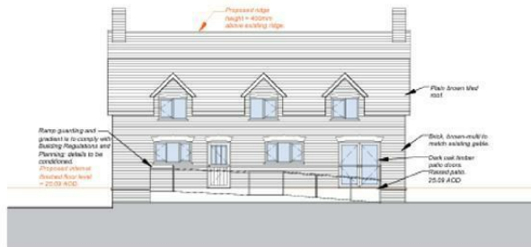
PROPOSED REAR ELEVATION (North) Scale 1:100